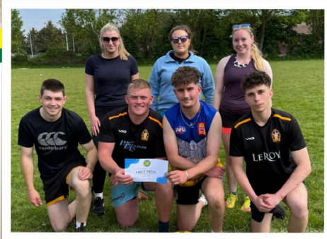
TAG RUGBY QUALIFIERS