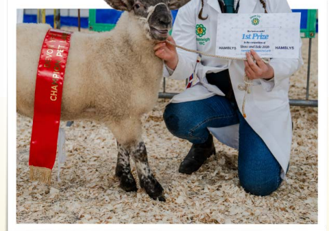
DEVON YFC SHOW & SALE 2026