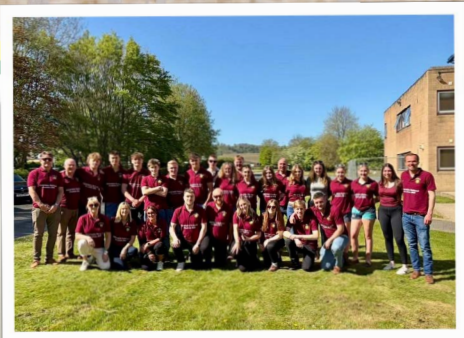
NATIONAL ENTERTAINS FINALS