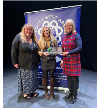
Devon win the overall points trophy at SWA!