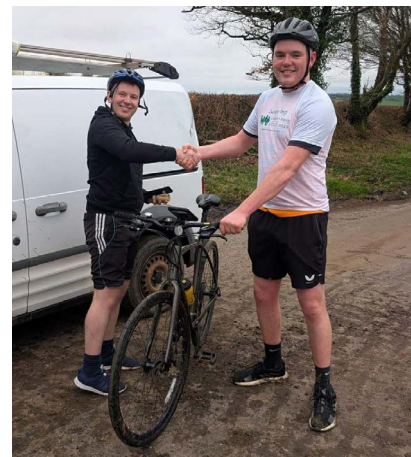
Woolser YFC Charity Cycle to Weymouth!