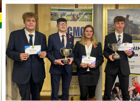
INTERMEDIATE BRAINTRUST RESULTS