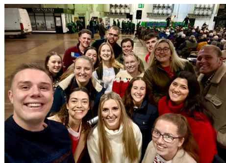
The Devon County Choir reunite for the FCN Carol Service