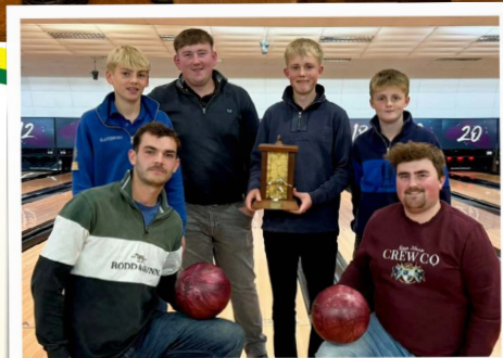
COUNTY BOWLING FINALS