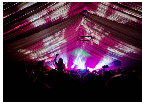
The Devon YFC Mistletoe Ball at Exe Valley Farm Shop