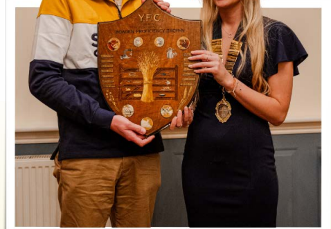
COUNTY AGM AWARD WINNERS