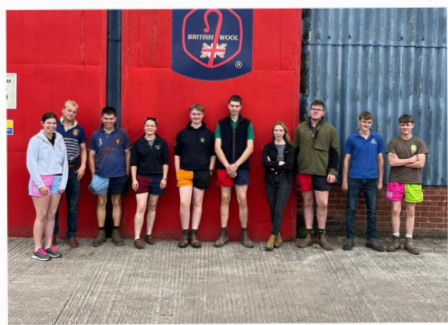
BRITISH WOOL AGRI TOUR