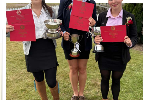
NATIONAL COMPETITIONS FINALS