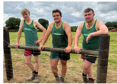
OUTDOOR ACTIVITIES DAY RESULTS