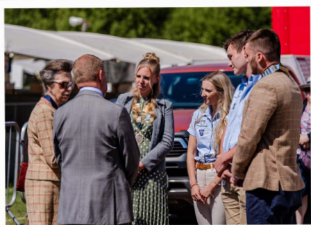
DEVON COUNTY SHOW 2025