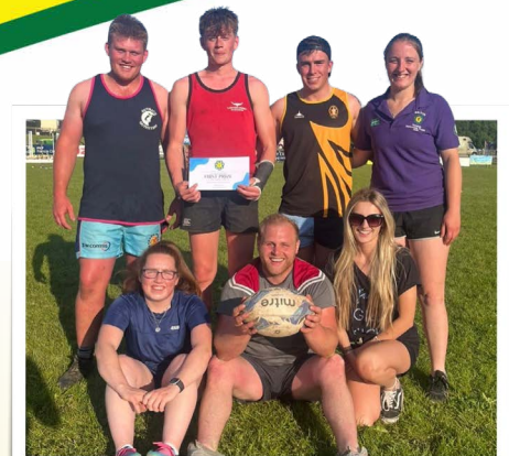
COUNTY TAG RUGBY FINAL RESULTS