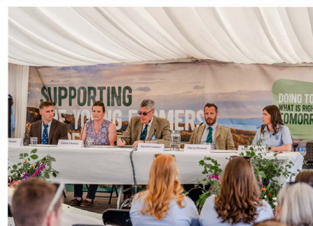
THE ANNUAL AGRI DEBATE