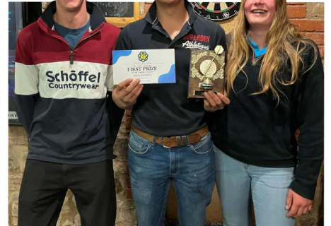
COUNTY PUB SPORTS RESULTS