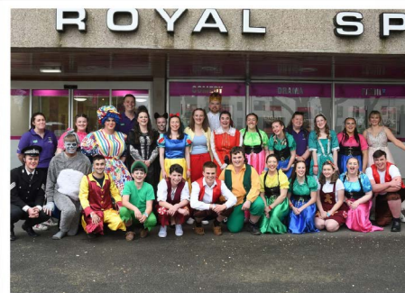
NATIONAL PANTOMIME FINALISTS