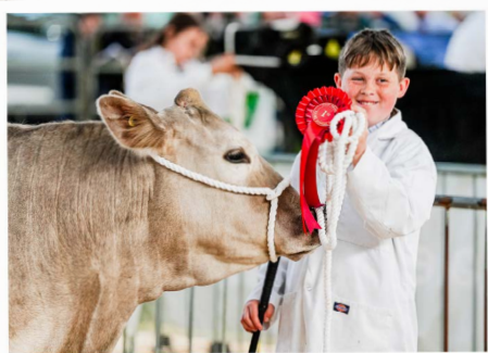
LIVESTOCK SHOW & SALE 2025