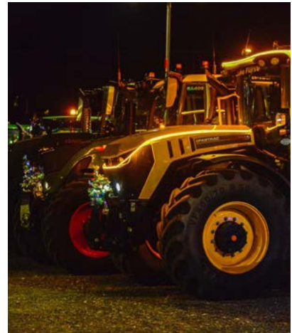
Woolsery YFC and Clawton YFC Tractor Runs