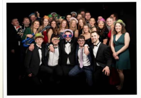
CLUB UPDATES: HONITON, LEWDOWN, WOOLSERY & CLAWTON