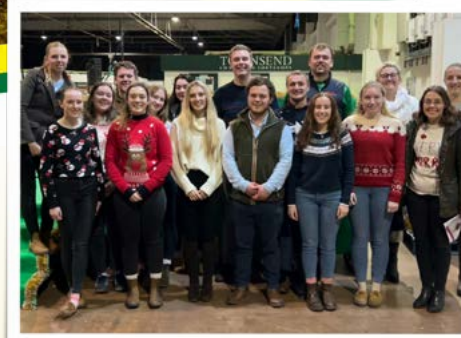
FCN CAROL SERVICE & THE COUNTY CHOIR