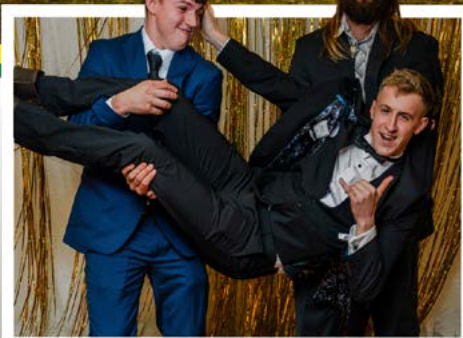
DEVON YFC CHRISTMAS BALL